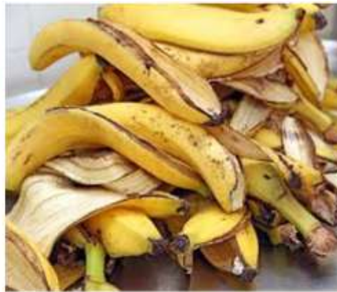
ii. Banana Peels