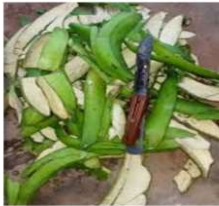
i. Plantain Peels

The bio-digester was a 0.2 m 3 made from plastic materials. Other accessories of the bio-digesters include steel; compressor, gas bottle, scrubber, thermometer, a plastic bucket, manometer, connecting hoses and weighing scale. The biodegradable solid wastes that served as substrates (banana and plantain peels, Fig. 1) was measured with a universal weighing balance and recorded as sample A (Banana Peels, 20 kg) and sample B (Plantain Peels, 20 kg) respectively.