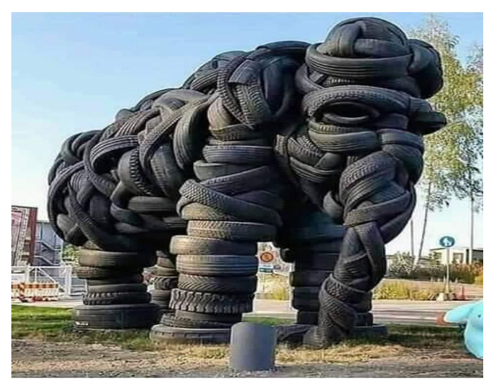
Figure 5: "An Elephant" Courtesy: Egware-Pamela, (2019) UNIPORT, Nigeria

problems the communities. in Silently or subconsciously, these works, according to Osita, (2015) check, reduce, control or remove on the long run, such emotional or mental disorders that naturally oppress the mind. Also, there is a feeling that emanates from the works in the various studios, galleries or sculpture gardens, particularly, when such works are viewed objectively. Such feelings become very intrinsic and such intrinsic perceptual appeal results to emotional healing, psychological healing and remedies to other human disorders.