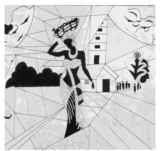
Figure 1: Chukwunonye, Overcomer "Culture" 2019, Pen and Ink, ABSU 60X45cm © Osita, Williams A. 2019

Sculpture is an aspect of visual arts, which emphasizes three dimensionality. It could be in relief or in the round. Sculpture works could be created in different media, ranging from stone, clay, metal, fibre, cement, bronze, waste materials (like junk), and found objects.