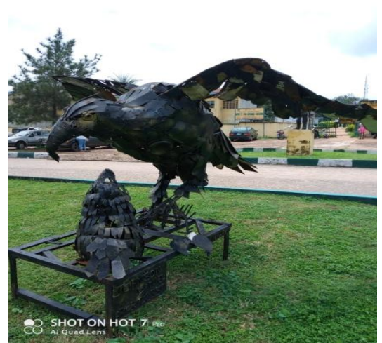
Figure 4: Daniel Johnson, "Eagle and child", 2017 ,ABSU, Metal/Found objects, (180X195) cm © Osita, Williams A. 2019

Also, it must be noted that visual art galleries or sculpture gardens serve as therapeutic centres for people with learning disabilities, behavioral or social