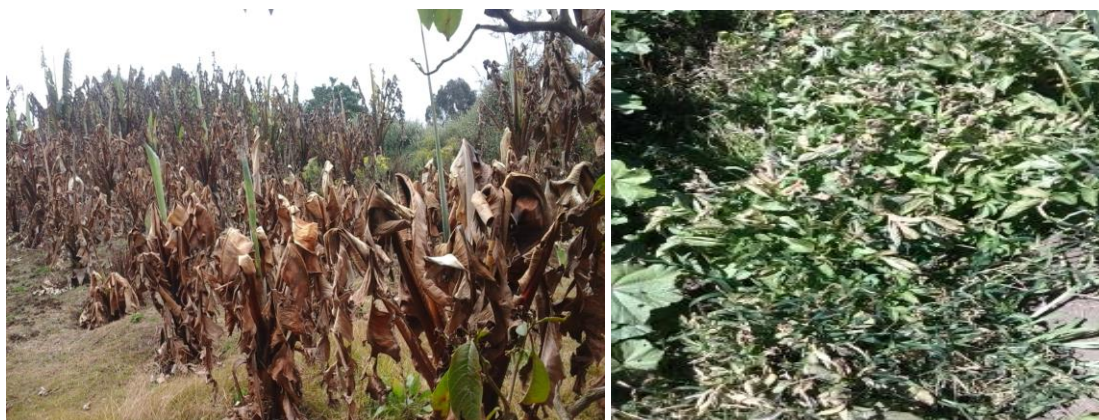
Plate 1: Damage of frost on Enset ( Ensete ventricosum ) and Potato ( Solanum tuberosum )