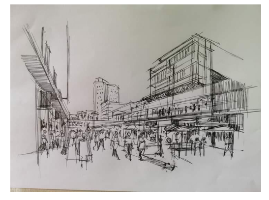
Figure 4: Freehand sketch, Opera.com, 2021