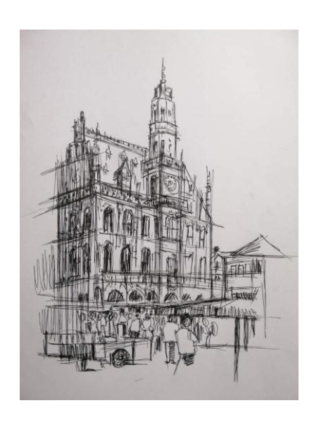
Figure 7: Freehand sketch, Opera.com, 2021