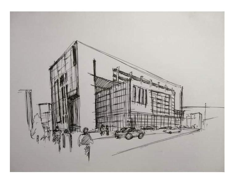
Figure 2: Freehand sketch, Opera.com, 2021

Architecture and tourism are salient and indispensable phenomena in realistic development of any nation. One may suggest, therefore, that the development of any society, must be anchored in the strong principle and belief that creativity and technological growth of any given society must be products of indigenous development through architecture and other creative arts enterprise. These on the other hand promote the people's values. Creative and modern architecture inspire and encourage tourism thereby promoting the economy