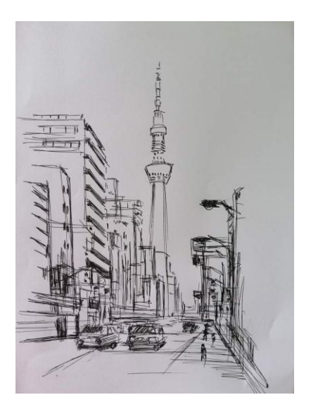
Figure 6:: Freehand sketch Opera.com, 2021

promote values as well as tourism and sustainable national development.