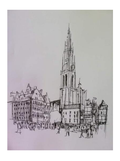
Figure 8: Freehand sketch, Opera.com, 2021