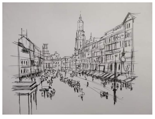
Figure 3::Freehand sketch Opera.com, 2021

and national values. The study, therefore, suggests that any nation that desires genuine growth and development, must aspire and aim at objectively produce not only thorough bred graduates of architecture, but focused and creative visual artists which in the long run exhibit the magnificent skills acquired in their training and acquisition of professional competences in creativity, render invaluable services to the economy in all sectors including tourism and hospitality industries.