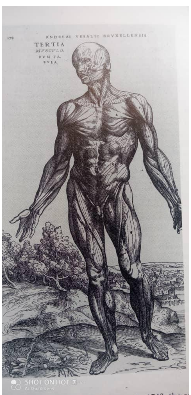
Figure 5: Human Anatomy by; Andreas' Vesalius (1543) "Seven Books on the Structure of the Human Body"

One could go on and on, documentation plays massive roles in scientific, cultural, historical development of any nation in Africa and cultural values. It is the view of the study that in Nigeria, documentation is not taken as serious business. No regard for history. The study also observes in the contemporary Nigeria, any policy or legislationnot directly related to politics, corruption, looting, Fulani herdsmen, banditry or oil bunkering may not be taken seriously. These in the short and long run affect sustainable development and huge loss of values. Architecture in African context may not develop significantly in isolation of history and documentation. Examples in low and high renaissance of Italian architecture one could understand how development of architecture evolved beyond what it is today. History and records are not significantly documented for futuristic focus in Nigeria. For example, what happens to prehistoric African architecture? What happens to African architecture without architects?