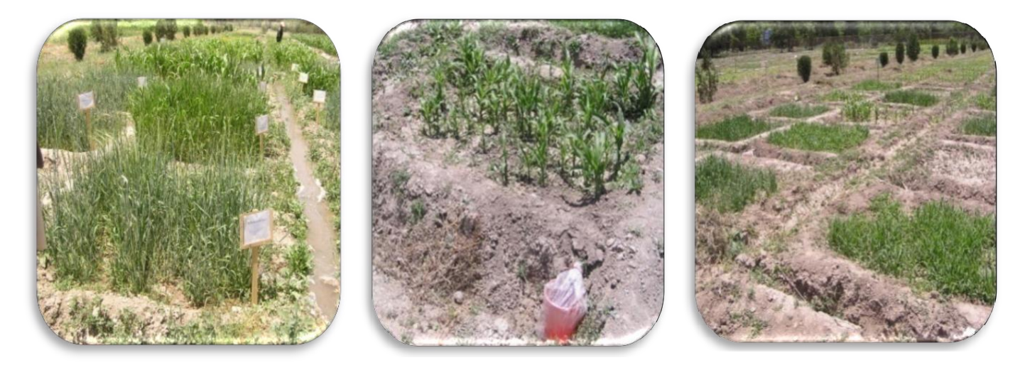
Figure 1: Treatments and view of installed plastic bucket for collection of sediments

Subsequent to the rainfall, the sedimentations (figure 1) have been collected and transferred to the laboratory; conical flask and filter paper were used for filtration of the sediments. The filtered material dried in room temperature. Subsequently the dried soil samples of each plot (treatment) were stored in polyethylene bottles and sealed until analysis of N, P, K and C.