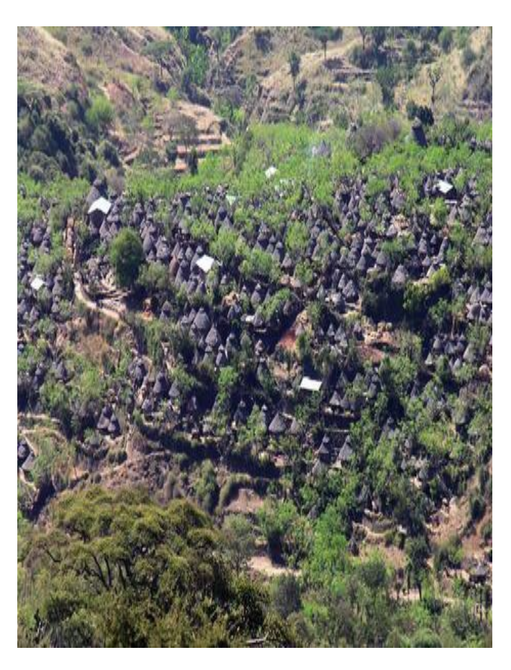
Figure 3-2: Walled village of Konso (Tamiru Karse2014)

As society considered some of advantages of their traditional society settlement is for emergency communication network and response. labour mobilization. During the past decades where there are no communication technology developed, this society build a community house, which called "Mora" with in the stone walled village called Pallet. It is one of open community big house still working till to day in their traditional administration courthouse or social network centre (village square). During the day morning time elder use Mora as traditional court, to settle out any dispute that happened within residents and mad all the conciliation activities and other social information need to be shared for the society. At least one male person from every household have to attend the morning information sharing session from the elder at "Mora" excluding the female. Female could only attend "Mora" if they only have traditional court issue and even so, they have to accompany by their intimate relative: brother, fathers or husbands. It forbidden by this