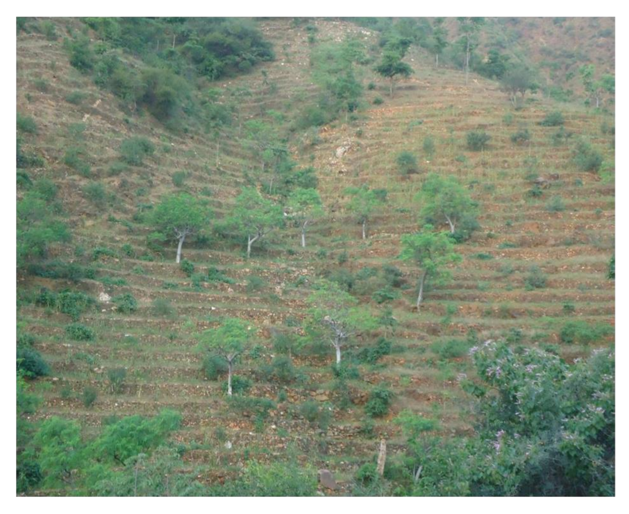
Figure 4-1: Stone terraced cultivated land in the study area (Tamiru Karse2014

Konso people use terraces not only for improving the farming productivity, and to protecting the soil erosion. However, the dry stone walled village called "paleta" also use as strategic and self-defensive advantage. Two layer walled dry stone with average height of three-meter circle every village, and the wall would have their main gate to take through in to village square. These main gats are close at night and secured during the night. This habit is not there anymore, were used during era of foreign colonization for such purpose.