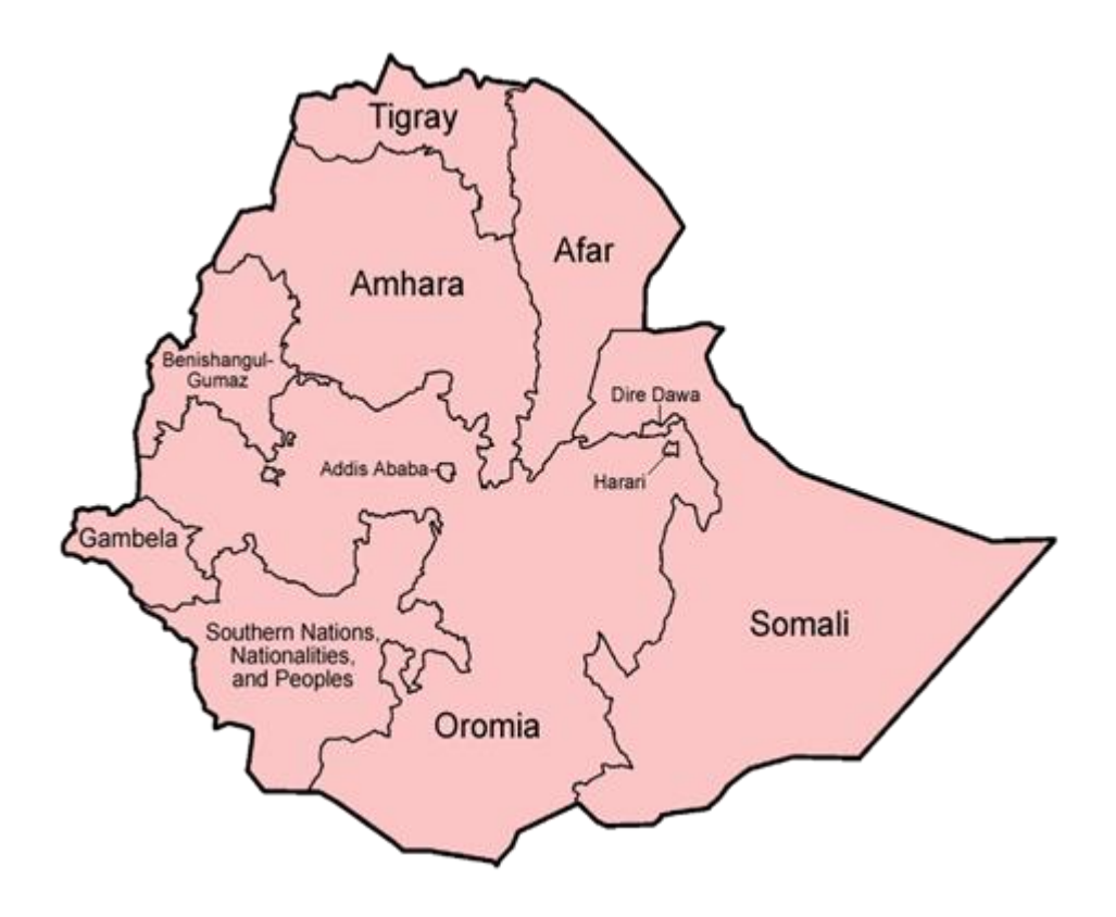
Figure 1: Map of Ethiopia and the nine regional states

contamination resulted from soil erosion, agricultural runoff, domestic and industrial wastes. However, there is no comprehensive information about the water quality status of the country. Therefore, this paper aims to examine the concentration of nitrate in the well water, spring water and tape water which were collected and analysed from different regions of Ethiopia.