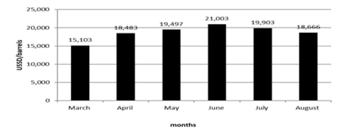
Figure 1: Crude oil Prices