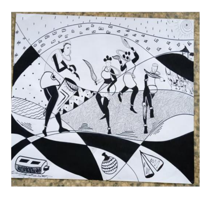
Figure 3: Obioma Precious, Pen and Ink, Culture, ABSU, 2019, 70 x 60cm. © Osita, Williams A.