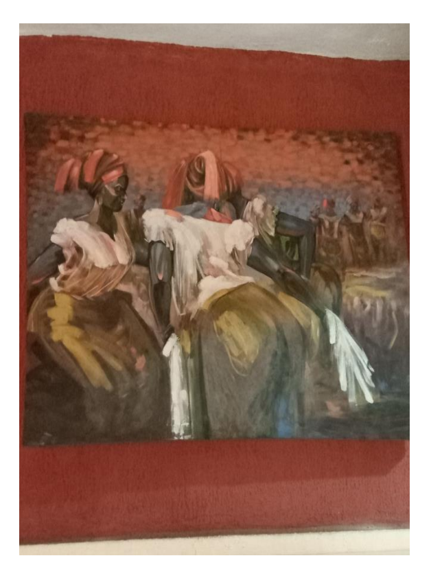
Figure 1: Obianeri, Fabian, August Meeting, Oil on canvas, 90 x 70 cm, 2016 ABSU ©