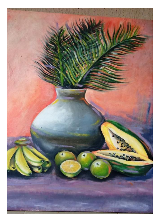
Figure 2: Odikwa, Adanna, Unity, Oil on Canvas, 2018, ABSU, 90 x 70cm, © Osita Osita Williams A. Williams A.