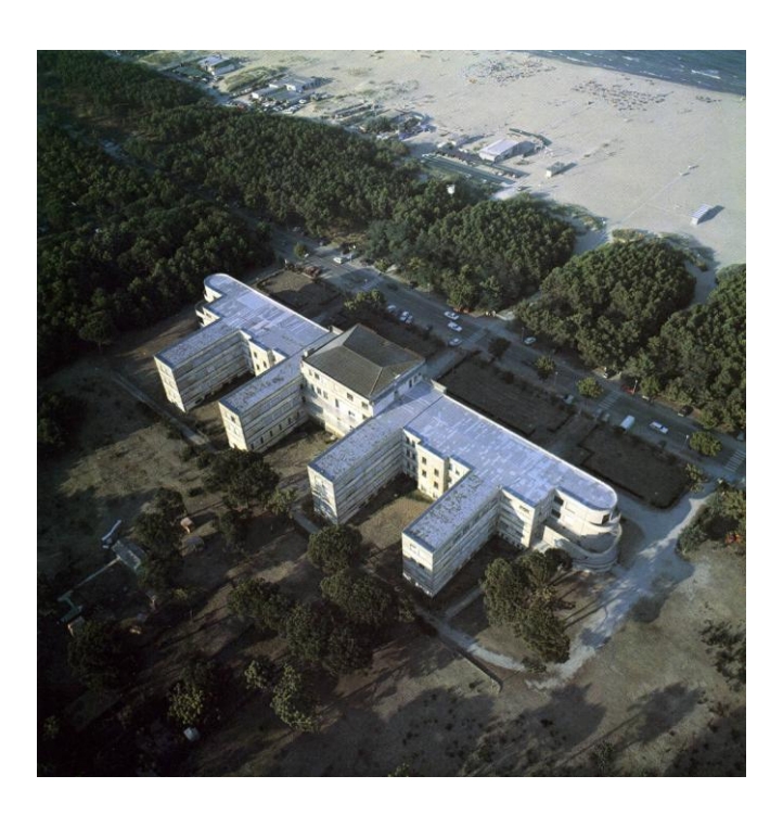
Figure 1: An already functioning building on the Ravenna's coast