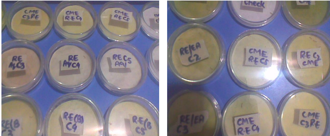
Figure 3. The residual effects of the hill toon, Cedrela serrata Royle extracts' 4 fractions were determined when 5 doses of each, i.e., 20.4, 25.5, 30.6, 35.7 and 40.8 \mu\text{l}/\text{cm}^2 , viz., C 1 , C 2 , C 3 , C 4 and C 5 , respectively, were applied by contact (filter feeding) method and 5 pairs of fresh 5 th instar of the red flour beetle, Tribolium castaneum (Herbst) were released daily up to 7 d in petri dishes, without changing filter paper and mortality % was observed after each 24 h.

castaneum were released in each petri dish. All batches were kept without food. The mortality counts were recorded after each 24 h. The experiments were discarded, if the mortality was more than 10% in C E and C S . Results were shown in percentage (%) for each fraction and dose. Three replications were set for 4 fractions of 5 doses and performed for consecutive 7 d.