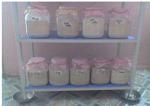
Figure 1. Rearing of the red flour beetle, Tribolium castaneum (Herbst) in bottles were kept in stand and box using light source in the Molecular Biology Laboratory, Department of Biochemistry, Hazara University, Mansehra, Pakistan

calamus L. Among the petroleum ether, acetone and ethanol extracts of C. longa , acetone extracts was the best repellent inhibitor against peach fruit fly, Bactrocera zonata Saunders (Siddiqui et al., 2006). Plant extracts containing compounds such as terpene, steroid, alkaloid, phenolic and cardiac glycosides (Duke, 1990) are known to affect insect behaviour and can function as deterrent to insect pests (Blaney et al., 1988; Ge and Weston, 1995; Mordue et al., 1998; Mancebo et al., 2000).