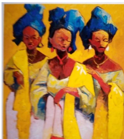
Figure. 3: Artist: Joe Musa Title: Aso Ebi II Medium: Oil on Canvas Size: 42" x 60" Year: 2007