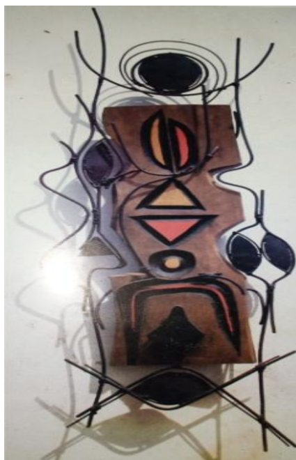
Figure. 2: Artist: Chris Afuba Title: Mbo Agu (The Tiger Asleep) Medium: Wood and Metal Year: 2008