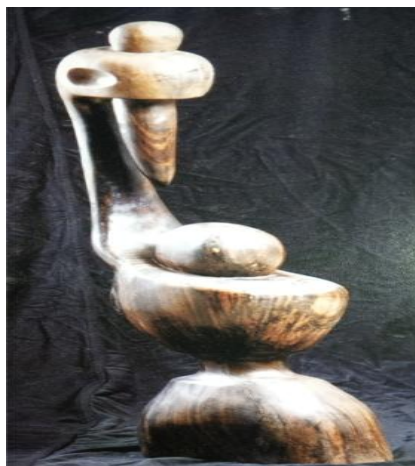
Figure. 4: Artist: Okpu Eze Title: Sacrifice (Birth and Death) Medium: Ebony Wood Size: 78 x 30cm Year: 1984