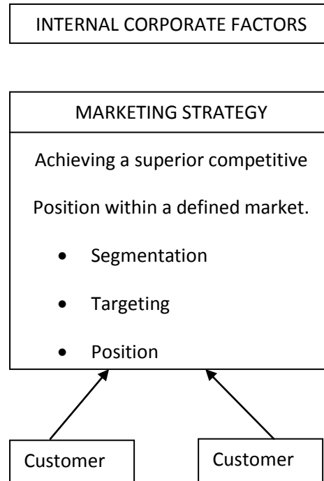
Figure 1: The basis of marketing strategy

As a process strategic marketing has three distinct phases